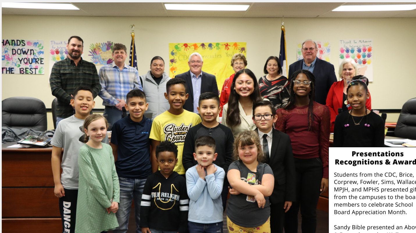
MPISD Board of Trustees & campus representatives