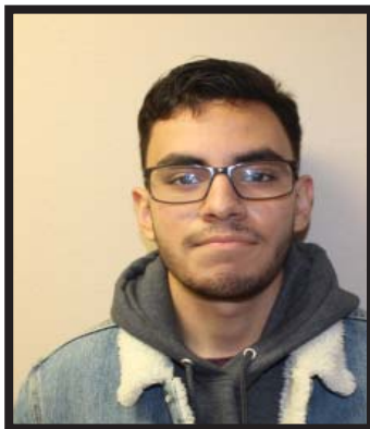
“Eminem” -- Ruben Carreon