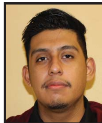
“The Weeknd”