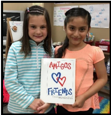
Book written and illustrated by MPISD Dual Language students

For more information on the Two-Way Dual Language Program please contact: