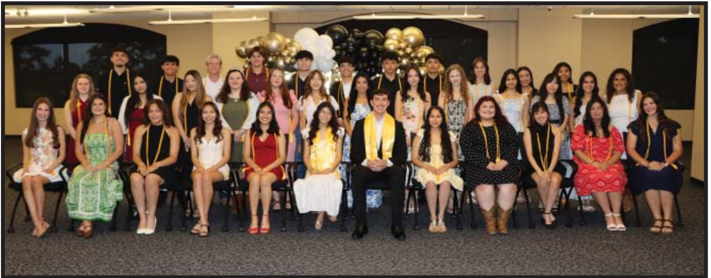
MPHS Class of 2026 Top Ten Percent Honor Graduates