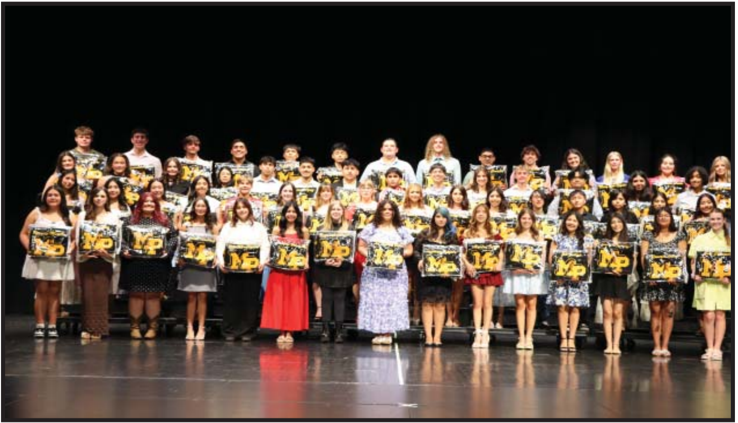
The 2026 Mount Pleasant High School Academic Blanket recipients