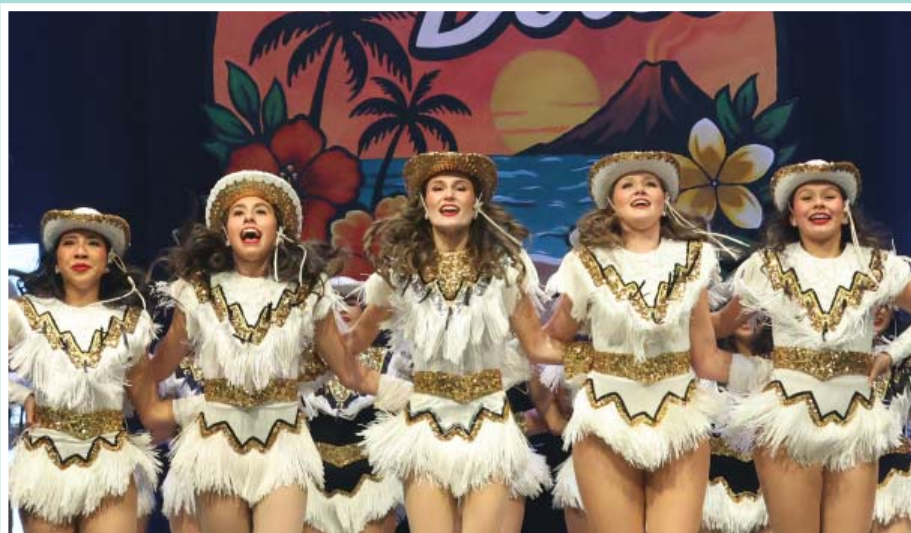
Tiger Dolls Spring Show