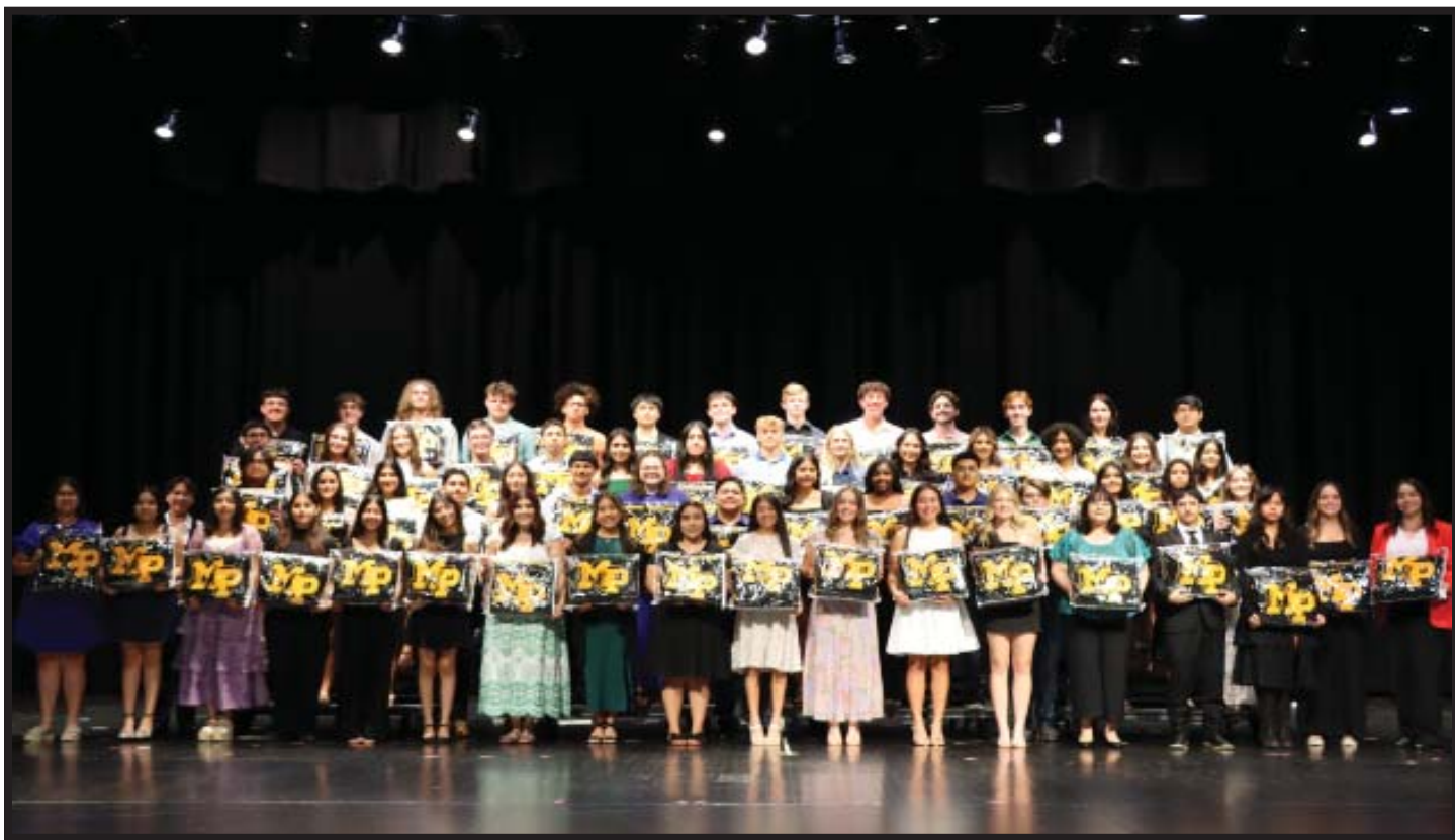
Academic Blanket recipients