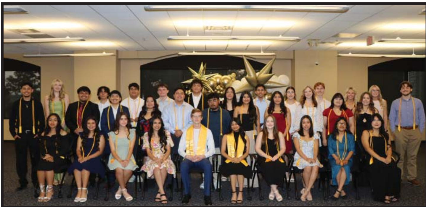
MPHS Class of 2025 Honor Graduates