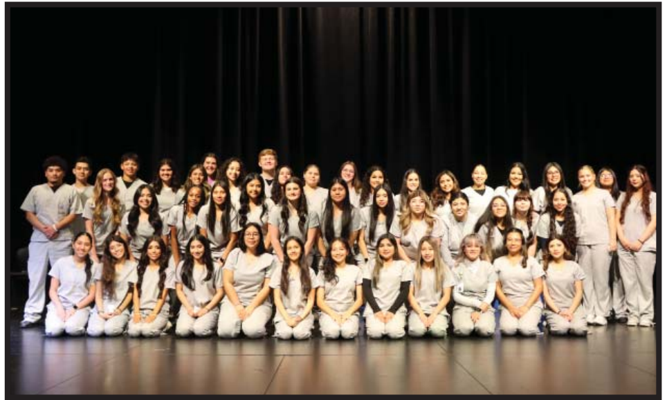
Certified EKG Technicians and Certificate of Completion recipients