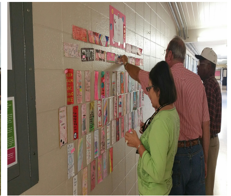
A special thanks to the school members for judging the red ribbon week ribbon contest.