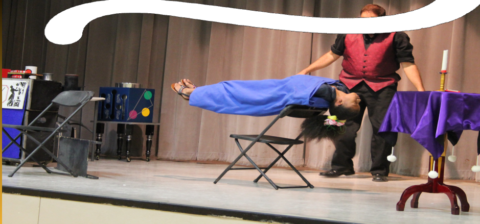
Wallace student gets the opportunity to participate in Red Ribbon Week magic show!